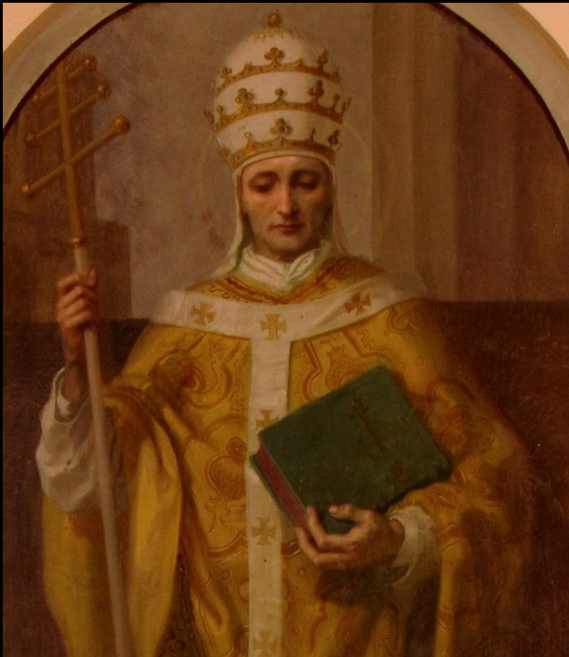
Pope Leo IX