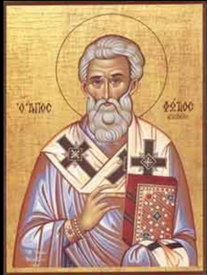
Cerularius, Patriarch of the Eastern church