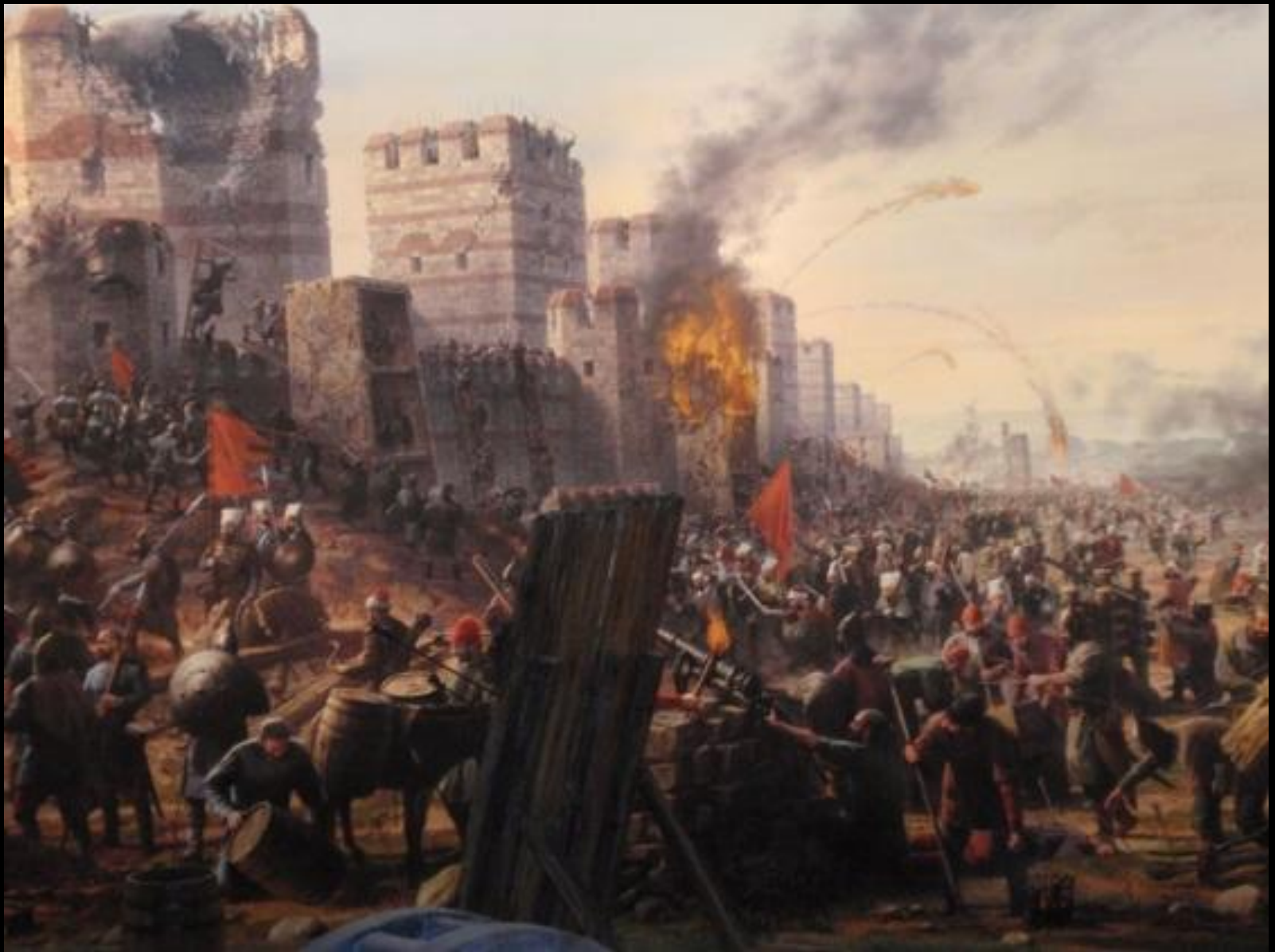
Fall of Constantinople, 1453