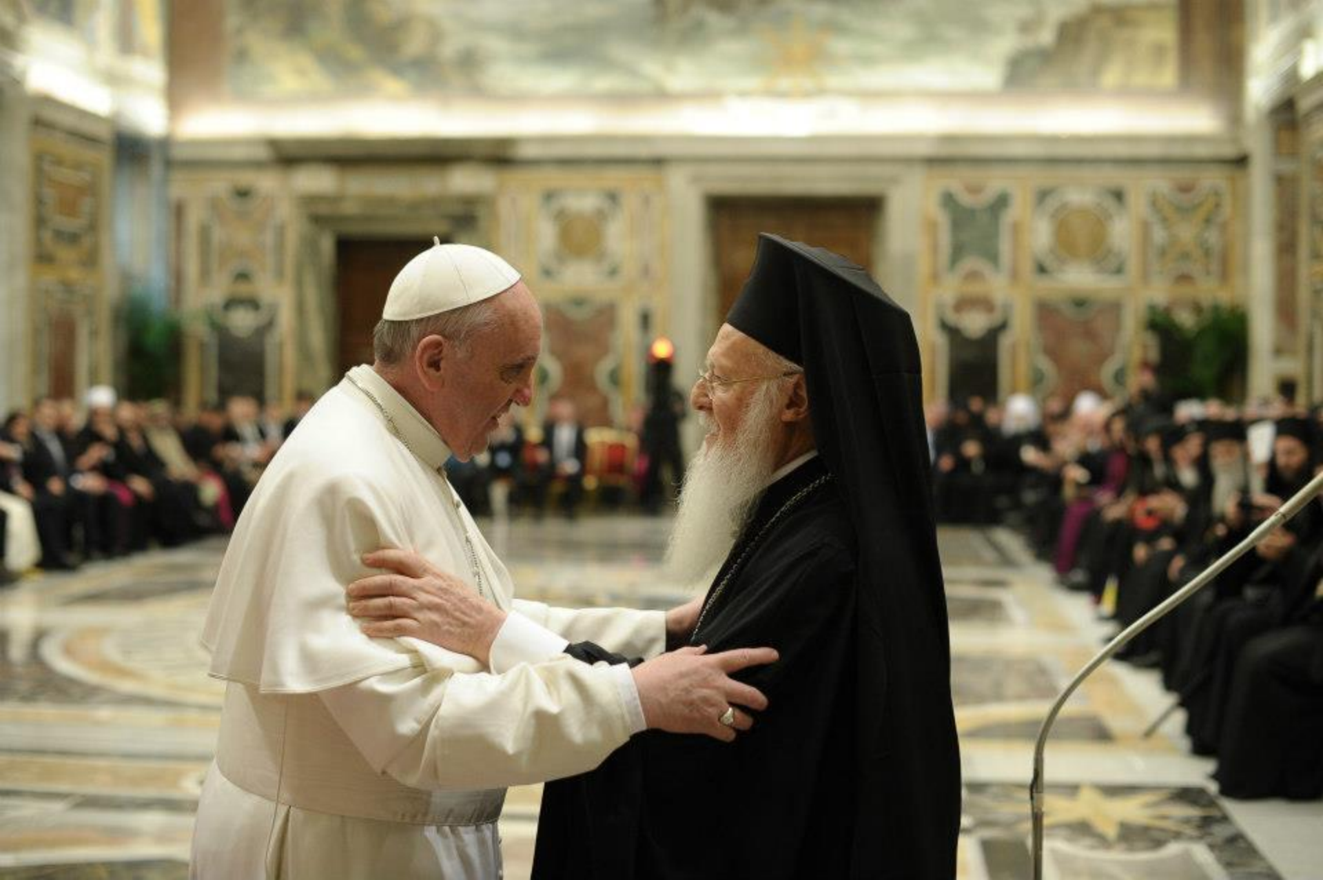
Pope Francis and Bartholomew I