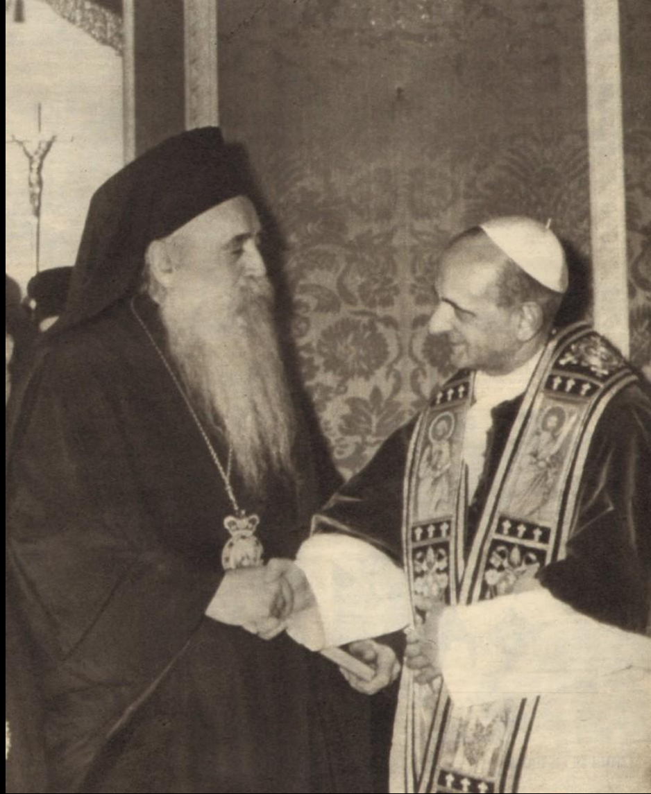
Pope Paul VI and Patriarch Athenagoras (1964)