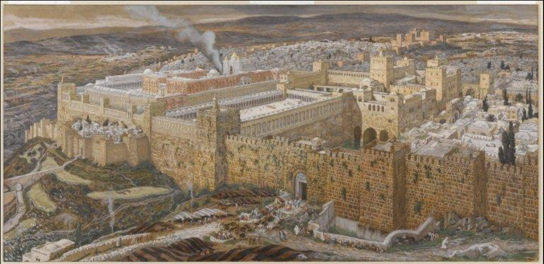
Jerusalem at the time of Herod